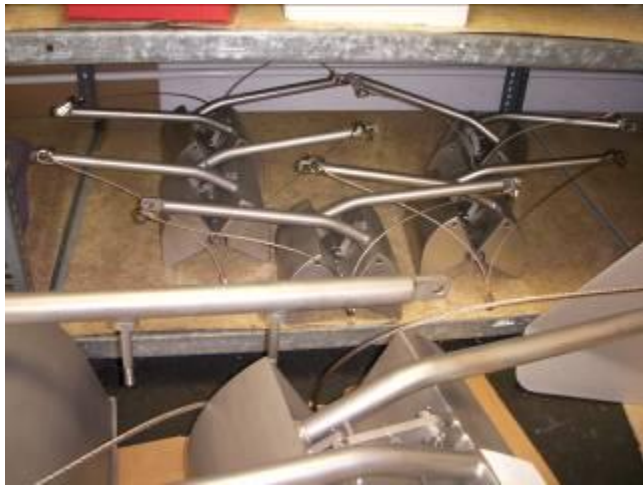
Van Veen 采泥器