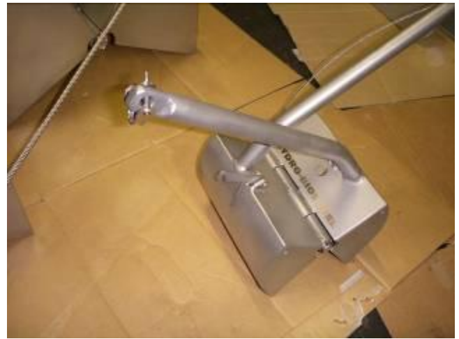
Van Veen 采泥器