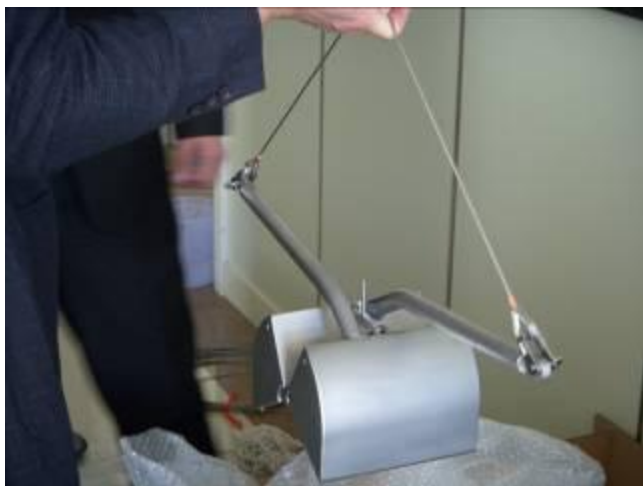
打开状态的 Van Veen 采泥器