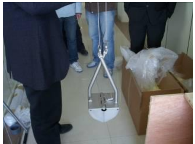
关闭状态的 Van Veen 采泥器